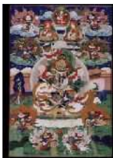
90130 (Ru 123)

In the thangka of "Guru Drakpochey and the Between-State Deities," no. 179 (557), p. 445f., the clouds are exactly those of a typical sMan-ris of dBus province, central Tibet, of the late nineteenth or early twentieth century. Note the repeated shape of the clouds and their unshaded outer edges. There is no reason to attribute this painting to Eastern Tibet.